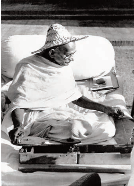
Gandhi spinning Noakhali