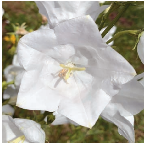
Flowers in Es à la Ligne