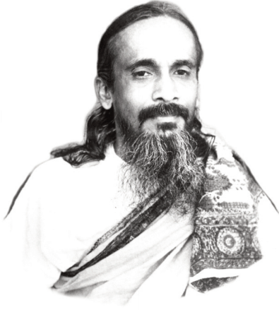
Kavi Yogi Shuddhananda Bharati