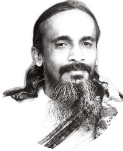
Kavi Yogi Shuddhananda Bharati