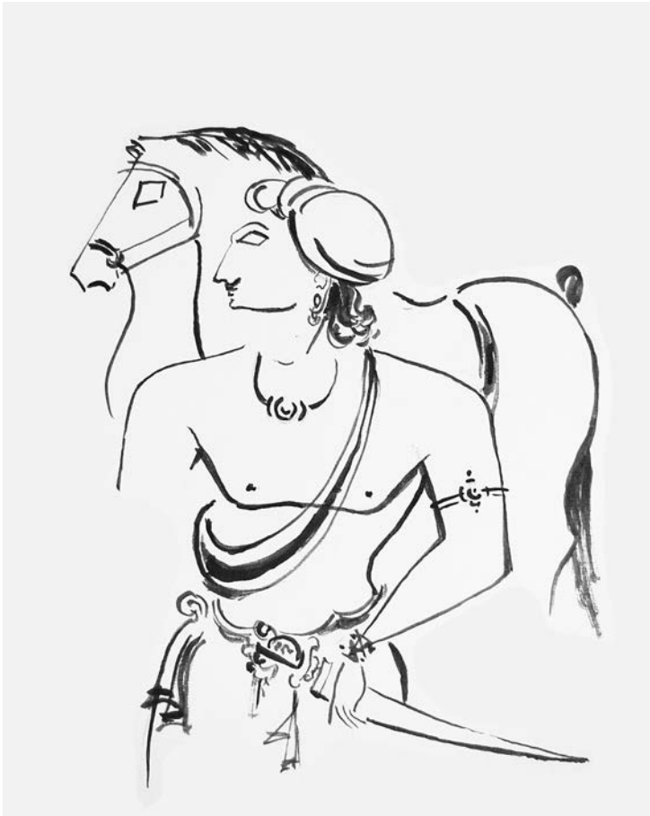
Veeraththevan , painting from A V Ilango