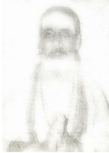
Yogi Shuddhananda Bharati