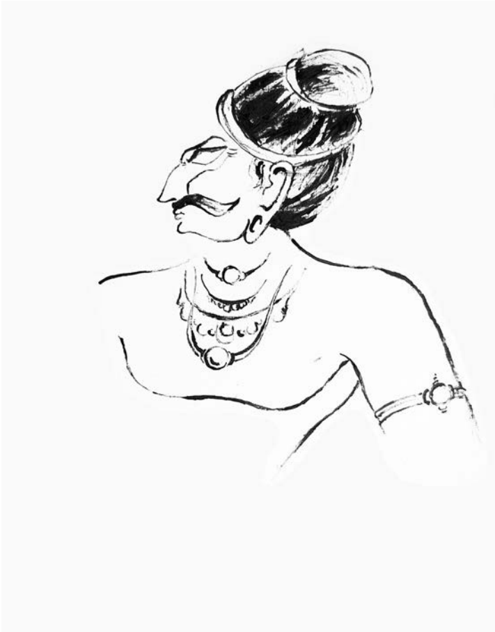
Veeraththevan , painting from A V Ilango